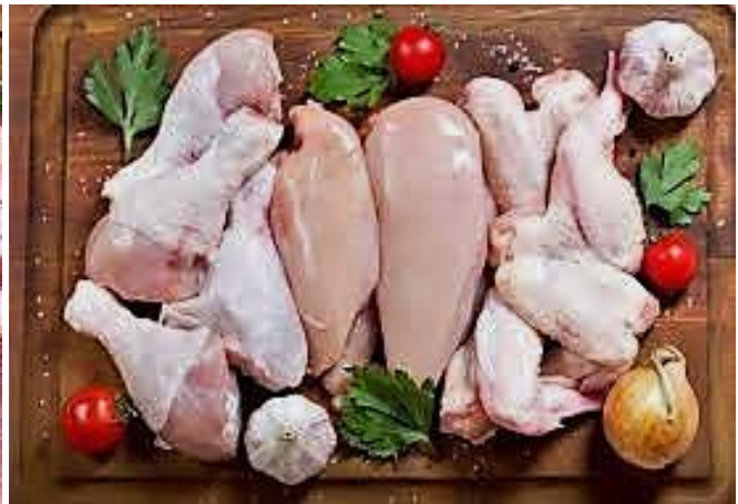
Fresh Cut to Your Liking! Only at Piper's Old Fashion Meat Market.